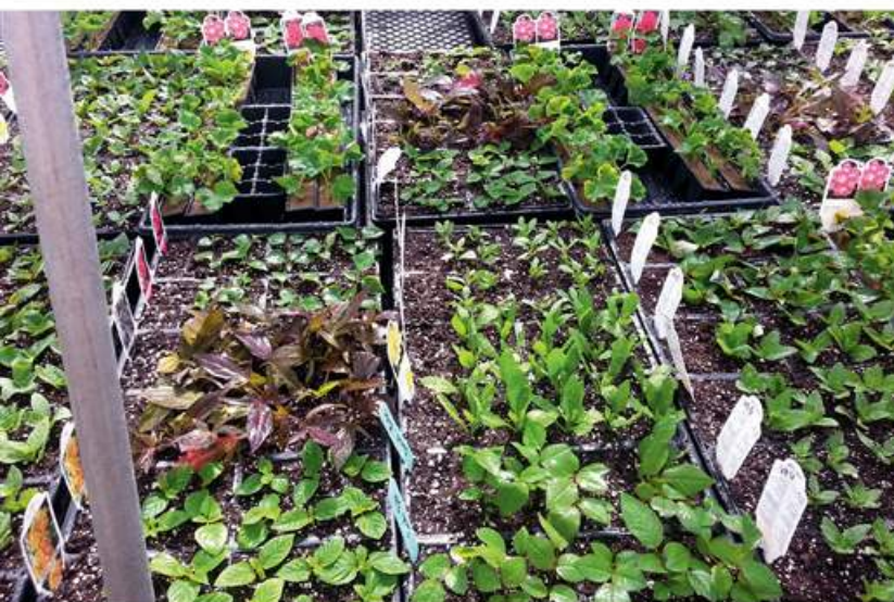
Figure 2. Trial at Vineland to screen bedding plant cuttings for phytotoxicity after dipping.