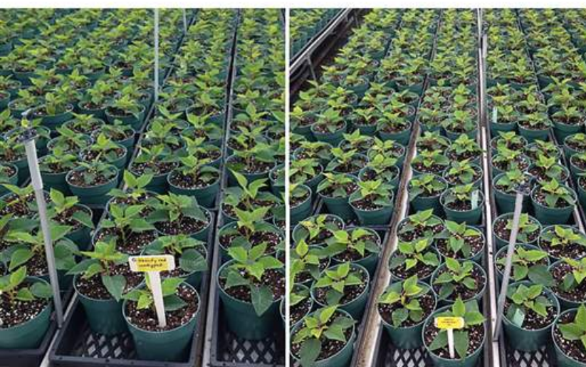
Figure 3. Dipped cuttings vs. non-dipped cuttings at a commercial poinsettia greenhouse.