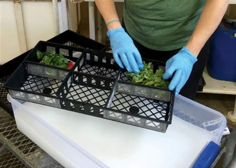
Figure 1. Example of a dipping setup. Cuttings can be kept separate by adding dividers to the dipping tray.