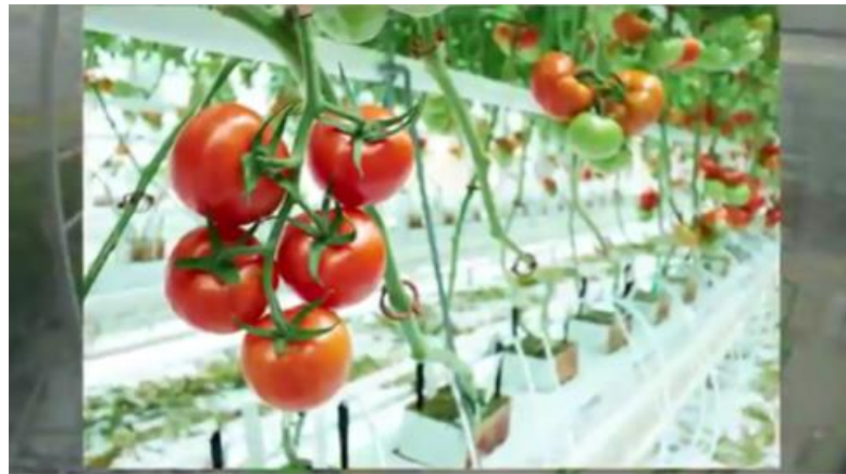
Greenhouse tomato time-lapse video

Check out an entire greenhouse tomato harvest in under two minutes. This video was shot at Vineland's Collaborative Greenhouse Technology Centre between January and May 2018 and features our new hybrid varieties https://tinyurl.com/y8gq8ppf