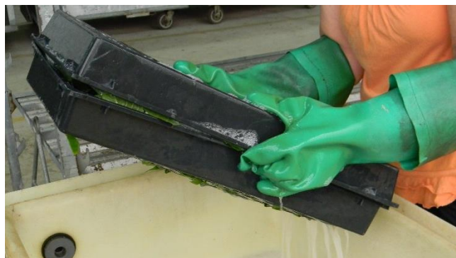
Dipping ornamental cuttings in a greenhouse to eradicate pests

In a 2018 survey conducted by Vineland, two-thirds of growers who participated said they are using cutting dips to eradicate pests before new ornamental crops take root in their greenhouses. More than 80 per cent also said it is a practice they will continue using to keep bugs at bay.