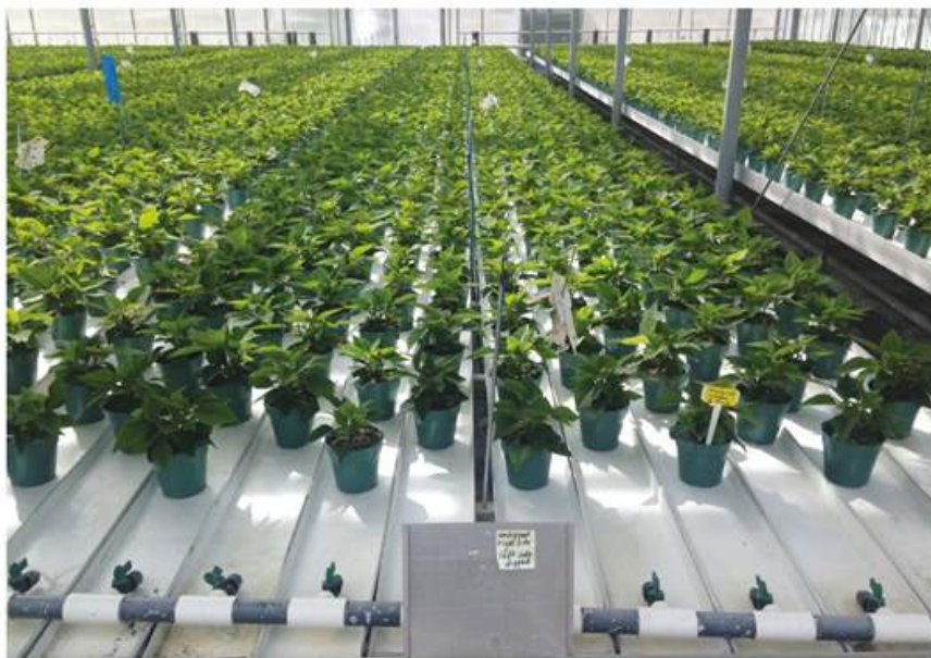
Figure 3. No negative effects of dipping were observed (undipped cuttings on the right and dipped cuttings on the left).