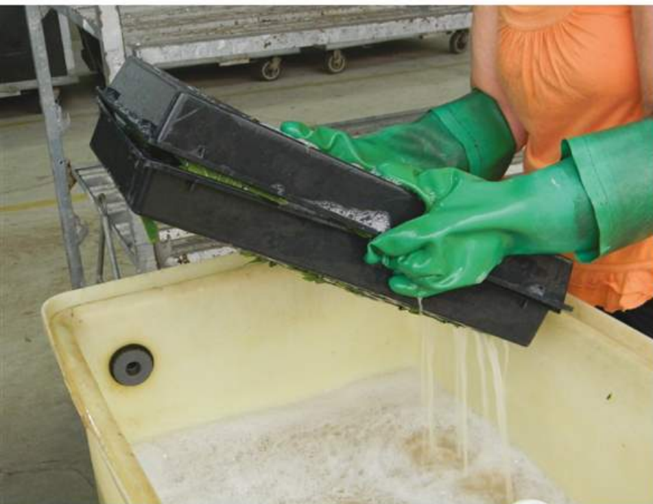
Figure 1. Cuttings are placed in a tray and immersed in a biopesticide solution.

Rates of insecticidal soap and oil had to be lowered significantly compared to the recommended spray rates to prevent phytotoxicity. Poinsettia is quite a sensitive crop, so other plant species may be able to tolerate higher rates. The dip residues on the cuttings were compatible with whitefly parasitoids Eretmocerus eremicus and Encarsia formosa , so biocontrol can be used after dipping.